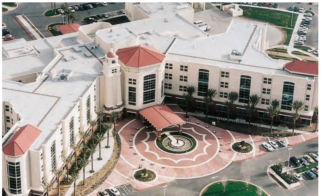
A Siplast Lightweight Insulating Concrete System and Paradiene 20/30 FR Roof System were installed on this Nevada hospital.