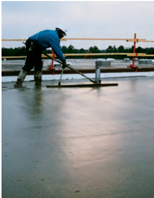
Siplast Lightweight Insulating Concrete is screeded to a smooth, durable, monolithic surface ideal for roofing application.

The relatively high density of Siplast Lightweight Insulating Concrete can positively affect membrane life by impeding extreme temperature fluctuations and the resulting thermal stresses that can cause membrane fatigue. And, since Siplast Lightweight Insulating Concrete Systems are reroofable, significant cost savings over the life of the building can be realized while eliminating the burden of rigid insulation tear-off and transportation to landfills.