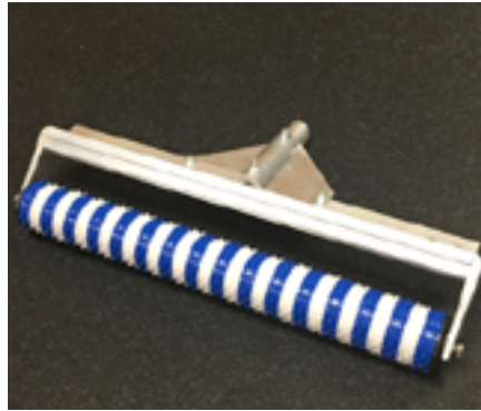
18" Pro Stub Roller – Base Coat

9/16" super-sharp spiked roller for levelling VTS Resin/Filler and removing small air bubbles. The roller is manufactured from high density polyethylene while the end caps are made from ultra-high molecular weight polyethylene to provide durability and allow for easy clean-up. Use with 18" Pro Spike and Stub Roller Frame (sold separately).