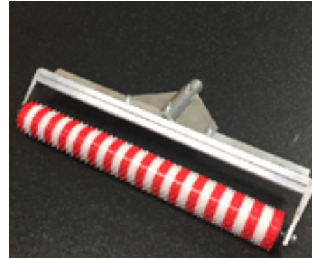
18" Pro Stub Roller – VTS

18" stub roller for application of the base coat of Terapro Base Resin and Parapro Roof Resin. The roller has alternating blue and white segments to differentiate it from the Pro Stub Roller VTS (red/white segments). The roller segments are manufactured from high density polyethylene while the end caps are made from ultra-high molecular weight polyethylene. Use with 18" Pro Spike and Stub Roller Frame (sold separately).