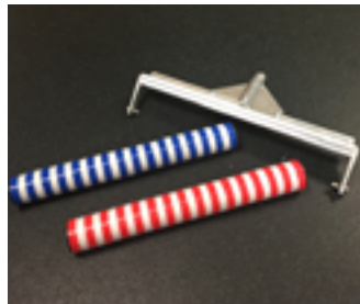
18" Pro Stub/Spike Frame

6" stub roller for stand-up application of VTS Resin/Filler. The roller segments are white and are manufactured from high density polyethylene while the end caps are made from ultra-high molecular weight polyethylene. Includes a frame. Replacement rollers are also available.