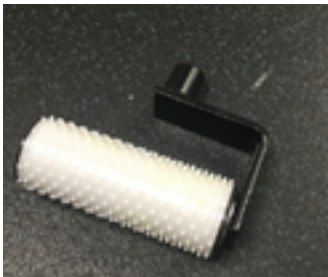
6" Pro Stub Roller – VTS

18" stub roller for stand-up application of VTS Resin/Filler. The roller has alternating red and white segments to differentiate it from the Pro Stub Roller – Base Coat (blue/white segments). The roller segments are manufactured from high density polyethylene while the end caps are made from ultra-high molecular weight polyethylene. Use with 18" Pro Spike and Stub Roller Frame (sold separately).