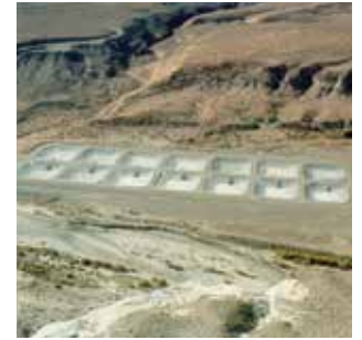
Teranap has an NSF Potable Approval, making it suitable for potable water storage applications.