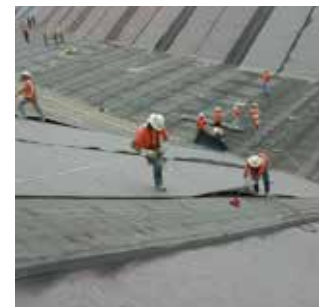
Torch welding of seams does not require special equipment or the use of chemicals for bonding.