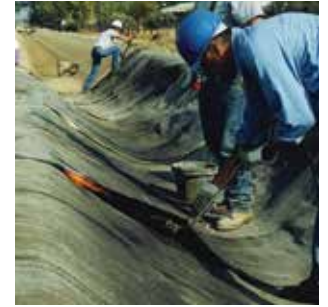
The simple torch welding technique used in Teranap installation helps to eliminate seam leakage problems.

For more information on Teranap Geomembrane, visit the Siplast Web site at www.siplast.com or call 1-800-922-8800.