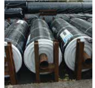
Teranap is available in 2-meter and 4-meter widths, and lengths from 20 to 100 meters.