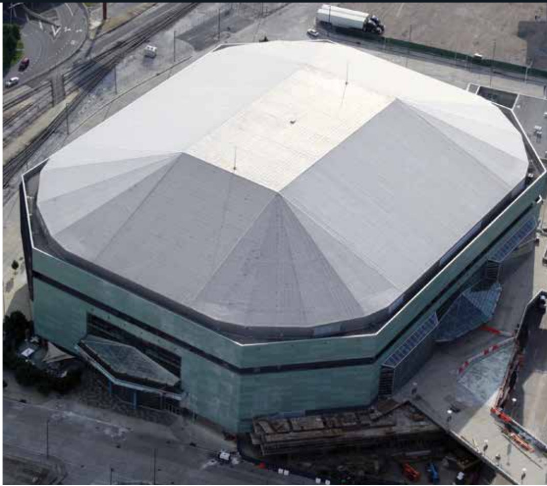
Siplast aluminum Veral, installed in 1998, still protects the New Orleans Sports Arena.

In Canada: 201 Bewicke Ave., Suite 208 North Vancouver, BC, Canada V7M 3M7 1.877.233.2338